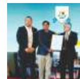
GOLD COLLEGE RATING IN QS INDIAN COLLEGE & UNIVERSITY RANKING, 2018