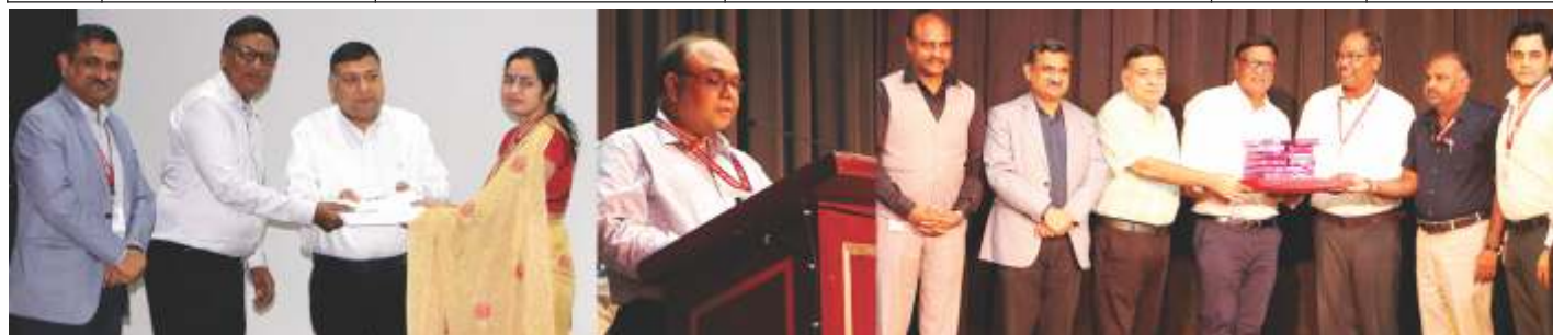
C. V. Raman Award Felicitation Ceremony